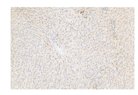
Immunohistochemical analysis of paraffinembedded human liver tissue slide using 29261-1-AP (ABCC2 antibody) at dilution of 1:1000 (under 10x lens). Heat mediated antigen retrieval with Tris-EDTA buffer (pH 9.0).