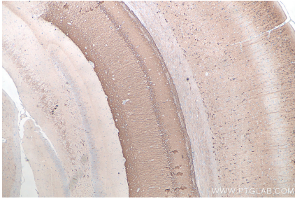
Immunohistochemical analysis of paraffin-embedded rat brain tissue slide using KHC0048 (WFS1 IHC Kit).