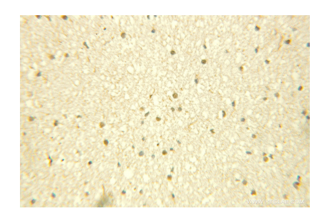
Immunohistochemical analysis of paraffinembedded human gliomas using 10614-1-AP (PKNOX1 antibody) at dilution of 1:100 (under 25x lens).