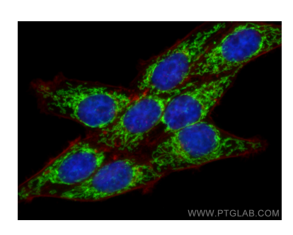
Immunofluorescent analysis of (4% PFA) fixed HepG2 cells using Tom22 antibody (11278-1-AP) at dilution of 1:400 and CoraLite®488-Conjugated Goat Anti-Rabbit IgG(H+L) (SA00013-2), CL594-Phalloidin (red).