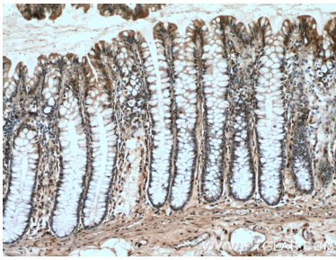
Immunohistochemical analysis of paraffin-embedded human colon tissue slide using 15134-1-AP (HRP 2 antibody at dilution of 1:200 (under 10x lens).