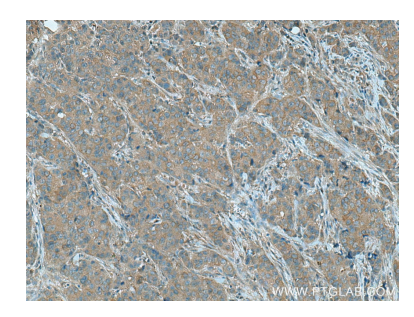
Immunohistochemical analysis of paraffinembedded human breast cancer tissue slide using 15550-1-AP (PGAM2 antibody) at dilution of 1:200 (under 10x lens). Heat mediated antigen retrieval with Tris-EDTA buffer (pH 9.0).