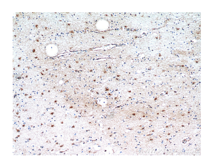
Immunohistochemical analysis of paraffinembedded human brain using 21142-1-AP (SCGBL antibody) at dilution of 1:50 (under 10x lens).