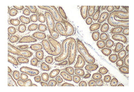
Immunohistochemical analysis of paraffinembedded mouse testis tissue slide using 22006-1-AP (TBP antibody) at dilution of 1:500 (under 10x lens). Heat mediated antigen retrieval with Tris-EDTA buffer (pH 9.0).