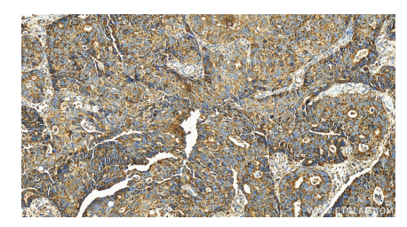
Immunohistochemical analysis of paraffinembedded human stomach cancer tissue slide using 55107-1-AP (SPTBN2 antibody) at dilution of 1:300 (under 20x lens). Heat mediated antigen retrieval with Tris-EDTA buffer (pH 9.0).