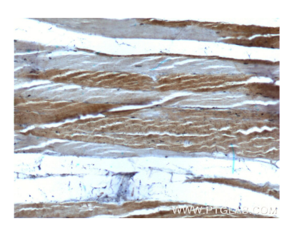
Immunohistochemical analysis of paraffinembedded human skeletal muscle tissue slide using 66212-1-Ig (Myosin 2a Antibody) at dilution of 1:100 (under 10x lens).

human skeletal muscle tissue were subjected to SDS PAGE followed by western blot with 66212-1-Ig (Myosin 2a antibody) at dilution of 1:100000 incubated at room temperature for 1.5 hours.