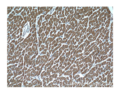
Immunohistochemical analysis of paraffinembedded human heart tissue slide using 66353-1-Ig (CBLB Antibody) at dilution of 1:200 (under 10x lens).