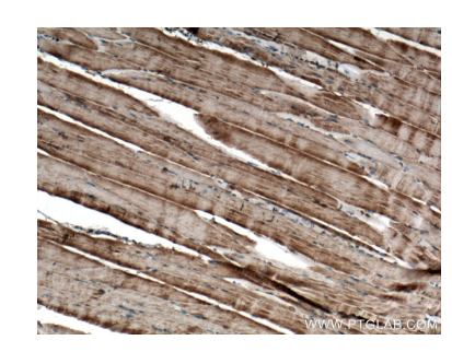
Immunohistochemical analysis of paraffinembedded mouse skeletal muscle tissue slide using 66539-1-Ig (RYR1 antibody) at dilution of 1:200 (under 40x lens. Heat mediated antigen retrieval with Tris-EDTA buffer (pH 9.0).