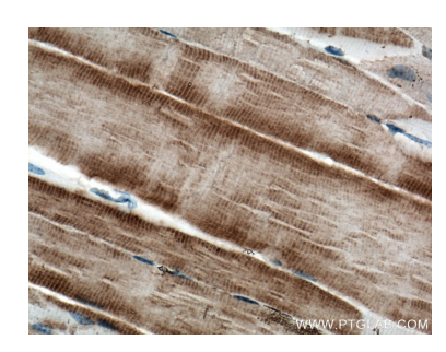
Immunohistochemical analysis of paraffinembedded mouse skeletal muscle tissue slide using 66539-1-Ig (RYR1 antibody) at dilution of 1:200 (under 10x lens. Heat mediated antigen retrieval with Tris-EDTA buffer (pH 9.0).