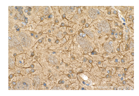
Immunohistochemical analysis of paraffinembedded mouse brain tissue slide using 67149-1-Ig (TROVE2 antibody) at dilution of 1:2000 (under 40x lens). Heat mediated antigen retrieval with Tris-EDTA buffer (pH 9.0).

HeLa cells were subjected to SDS PAGE followed by western blot with 67149-1-1g (TROVE2 antibody) at dilution of 1:10000 incubated at room temperature for 1.5 hours.