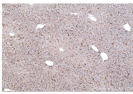
Immunohistochemical analysis of paraffinembedded mouse liver tissue slide using 67213-1-Ig (RHOQ/TC10 antibody) at dilution of 1:16000 (under 10x lens). Heat mediated antigen retrieval with Tris-EDTA buffer (pH 9.0).