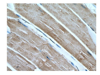
Immunohistochemical analysis of paraffinembedded mouse skeletal muscle tissue slide using 67366-1-Ig (CAPN3 antibody) at dilution of 1:200 (under 40x lens). Heat mediated antigen retrieval with Tris-EDTA buffer (pH 9.0).