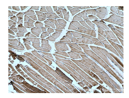
Immunohistochemical analysis of paraffinembedded mouse skeletal muscle tissue slide using 67366-1-Ig (CAPN3 antibody) at dilution of 1:200 (under 10x lens). Heat mediated antigen retrieval with Tris-EDTA buffer (pH 9.0).