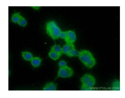
Immunofluorescent analysis of (-20°C Ethanol) fixed PC-12 cells using GPSM1 antibody (68233-1-Ig, Clone: 3A7A2) at dilution of 1:400 and CoraLite®488-Conjugated Goat Anti-Mouse IgG(H+L).

Various lysates were subjected to SDS PAGE followed by western blot with 68233-1-lg (GPSM1 antibody) at dilution of 1:5000 incubated at room temperature for 1.5 hours. The membrane was stripped and reblotted with HRP-conjugated GAPDH Monoclonal antibody (HRP-60004) as loading control.