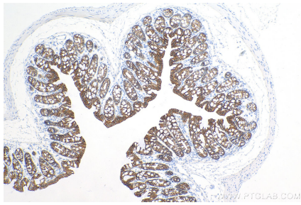
Immunohistochemical analysis of paraffin-embedded mouse colon tissue slide using 84111-1-RR (E-Cadherin antibody) at dilution of 1:2000 (under 10x lens). Heat mediated antigen retrieval with Tris-EDTA buffer (pH 9.0).