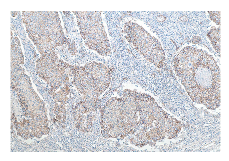
Immunohistochemical analysis of paraffinembedded human breast cancer tissue slide using KHC0009 (p120 Catenin IHC Kit).