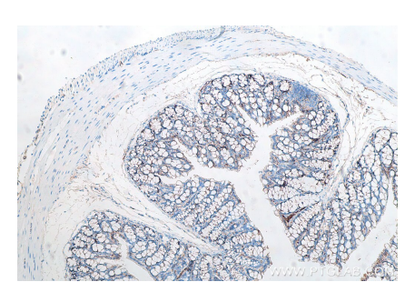
Immunohistochemical analysis of paraffinembedded mouse colon tissue slide using KHC0009 (p120 Catenin IHC Kit)