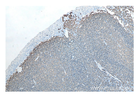
Immunohistochemical analysis of paraffinembedded human tonsillitis tissue slide using KHC0018 (CD20 IHC Kit).