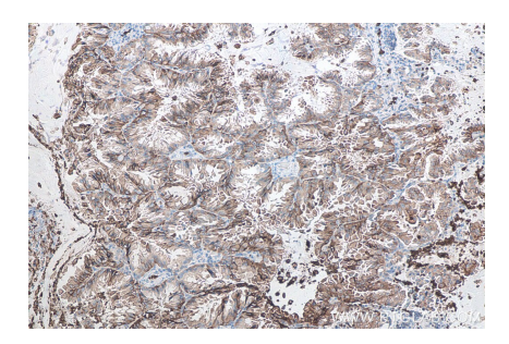
Immunohistochemical analysis of paraffinembedded human lung cancer tissue slide using KHC0036 (GLUT1 IHC Kit)