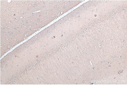
Immunohistochemical analysis of paraffin-embedded rat brain tissue slide using KHC0042 (TUBB3 IHC Kit).