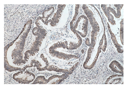
Immunohistochemical analysis of paraffinembedded human colon cancer tissue slide using KHC0152 (CBLL1 IHC Kit).