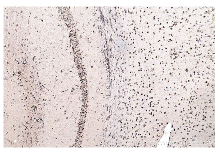
Immunohistochemical analysis of paraffinembedded mouse brain tissue slide using KHC0152 (CBLL1 IHC Kit).