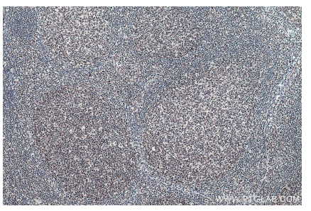
Immunohistochemical analysis of paraffinembedded human tonsillitis tissue slide using KHC0152 (CBLL1 IHC Kit).