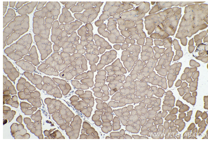
Immunohistochemical analysis of paraffinembedded mouse skeletal muscle tissue slide using KHC0338 (MYL3 IHC Kit).