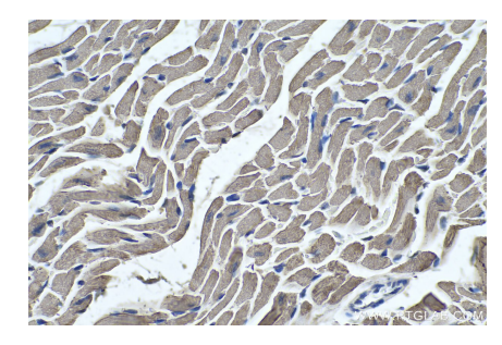
Immunohistochemical analysis of paraffinembedded mouse heart tissue slide using KHC0338 (MYL3 IHC Kit).