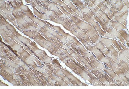
Immunohistochemical analysis of paraffinembedded rat skeletal muscle tissue slide using KHC0340 (MYL5 IHC Kit).