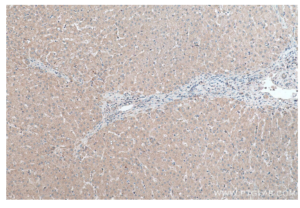
Immunohistochemical analysis of paraffinembedded human liver tissue slide using KHC0437 (MRPS28 IHC Kit).