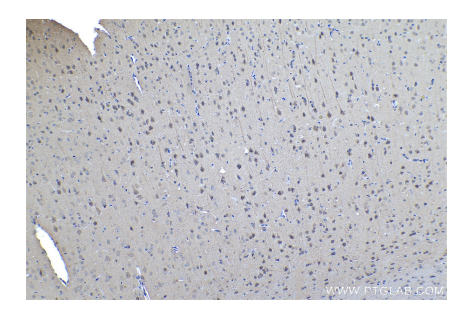
Immunohistochemical analysis of paraffinembedded rat brain tissue slide using KHC0448 (LPPR2 IHC Kit).