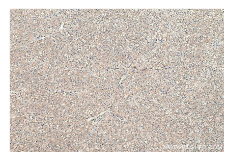
Immunohistochemical analysis of paraffinembedded human liver cancer tissue slide using KHC0453 (RBP1 IHC Kit).