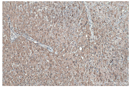
Immunohistochemical analysis of paraffinembedded human liver tissue slide using KHC0453 (RBP1 IHC Kit).