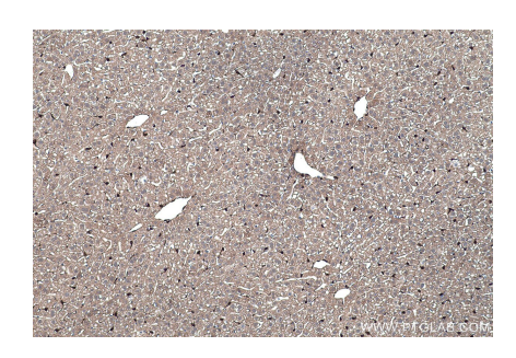
Immunohistochemical analysis of paraffinembedded mouse liver tissue slide using KHC0453 (RBP1 IHC Kit).