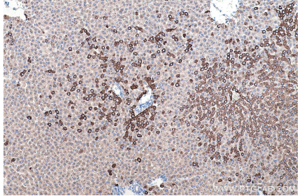
Immunohistochemical analysis of paraffinembedded rat liver tissue slide using KHC0525 (ALDH4A1 IHC Kit).

Immunohistochemical analysis of paraffinembedded mouse skeletal muscle tissue slide using KHC0525 (ALDH4A1 IHC Kit).