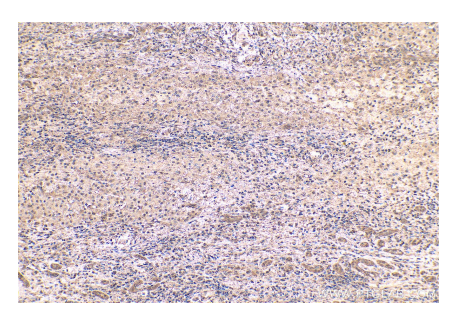
Immunohistochemical analysis of paraffinembedded human liver cancer tissue slide using KHC0559 (YWHAZ IHC Kit).