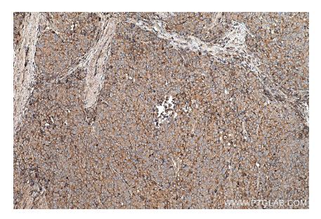
Immunohistochemical analysis of paraffinembedded human stomach cancer tissue slide using KHC0722 (CD63 IHC Kit).