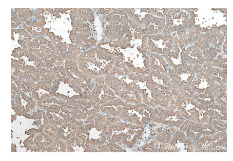
Immunohistochemical analysis of paraffinembedded human lung cancer tissue slide using KHC0722 (CD63 IHC Kit).