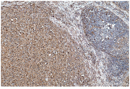
Immunohistochemical analysis of paraffinembedded human lymphoma tissue slide using KHC0722 (CD63 IHC Kit).