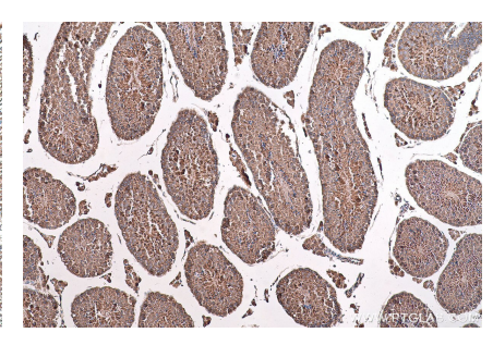
Immunohistochemical analysis of paraffinembedded mouse testis tissue slide using KHC0809 (SLC16A12 IHC Kit).