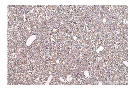
Immunohistochemical analysis of paraffinembedded mouse liver tissue slide using KHC0829 (SORBS2 IHC Kit).