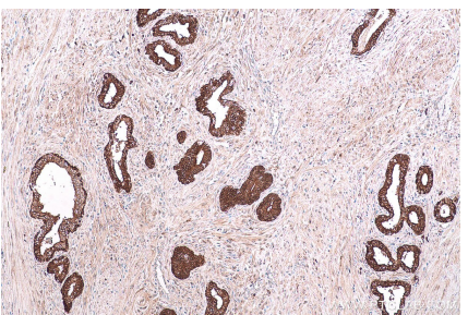
Immunohistochemical analysis of paraffinembedded human prostate cancer tissue slide using KHC0839 (PHGDH IHC Kit).