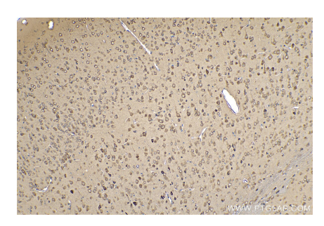
Immunohistochemical analysis of paraffinembedded mouse brain tissue slide using KHC0843 (DARSIHC Kit).