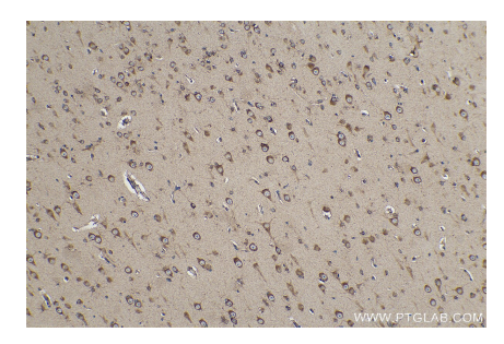
Immunohistochemical analysis of paraffinembedded human gliomas tissue slide using KHC0843 (DARS IHC Kit).