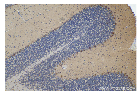
Immunohistochemical analysis of paraffinembedded rat cerebellum tissue slide using KHC0843 (DARS IHC Kit).