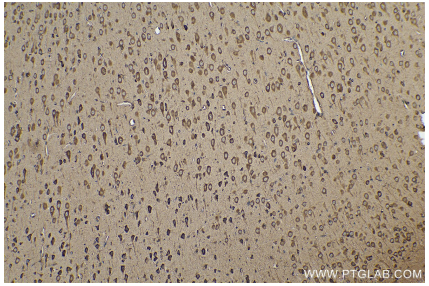
Immunohistochemical analysis of paraffinembedded rat brain tissue slide using KHC0843 (DARSIHC Kit).