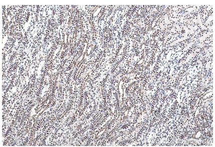
Immunohistochemical analysis of paraffinembedded rat kidney tissue slide using KHC0923 (DCPSIHC Kit).