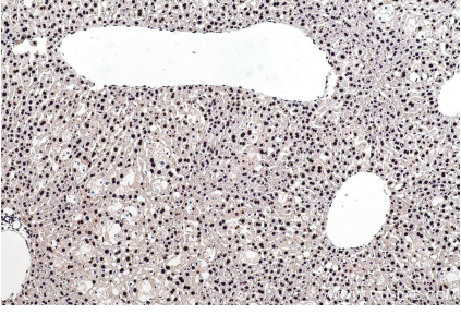
Immunohistochemical analysis of paraffinembedded mouse liver tissue slide using KHC0923 (DCPSIHC Kit).