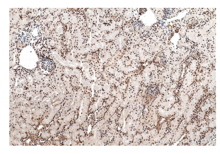
Immunohistochemical analysis of paraffinembedded mouse kidney tissue slide using KHC0923 (DCPS IHC Kit).