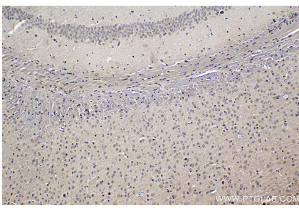
Immunohistochemical analysis of paraffinembedded mouse brain tissue slide using KHC1202 (NUP85 IHC Kit).