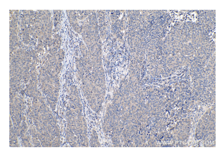
Immunohistochemical analysis of paraffinembedded human stomach cancer tissue slide using KHC1202 (NUP85 IHC Kit).