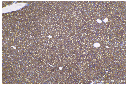
Immunohistochemical analysis of paraffinembedded mouse liver tissue slide using KHC1363 (LAMP2 IHC Kit).