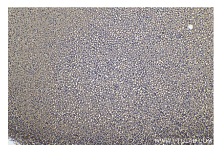
Immunohistochemical analysis of paraffinembedded rat adrenal gland tissue slide using KHC1459 (AIRE IHC Kit).