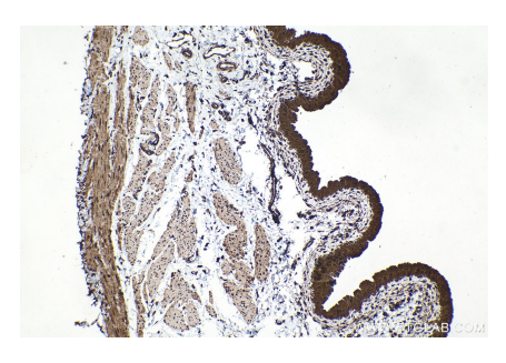
Immunohistochemical analysis of paraffinembedded rat bladder tissue slide using KHC1522 (RARB IHC Kit).