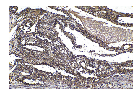
Immunohistochemical analysis of paraffinembedded human renal cell carcinoma tissue slide using KHC1522 (RARB IHC Kit).