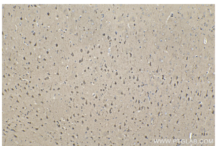
Immunohistochemical analysis of paraffinembedded rat brain tissue slide using KHC1522 (RARB IHC Kit).