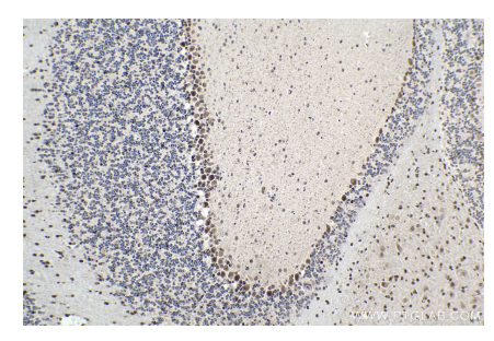
Immunohistochemical analysis of paraffinembedded mouse cerebellum tissue slide using KHC1568 (ARNT IHC Kit).