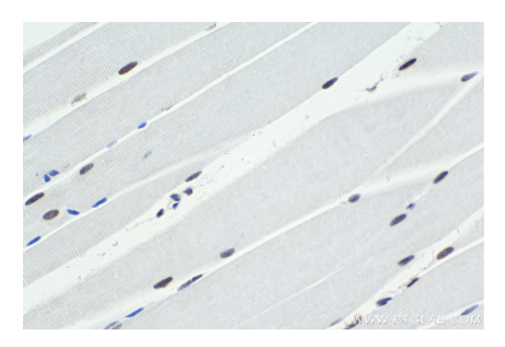
Immunohistochemical analysis of paraffinembedded mouse skeletal muscle tissue slide using KHC1643 (WDR5 IHC Kit).