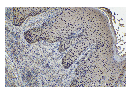
Immunohistochemical analysis of paraffinembedded human skin cancer tissue slide using KHC1852 (TFAP2C IHC Kit).