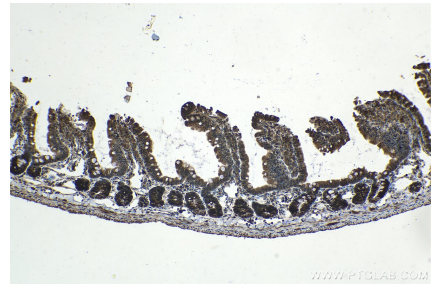
Immunohistochemical analysis of paraffin-embedded rat small intestine tissue slide using KHC2052 (UBE2C IHC Kit).