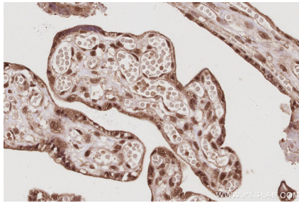
Immunohistochemical analysis of paraffin-embedded human placenta tissue slide using KHC3083 (USP16 IHC Kit).